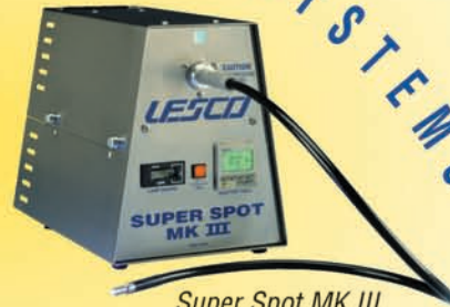
Super Spot MK III Maximum intensity - 20W/cm 2 peak UVA 25W/cm 2 peak in UV-VIS