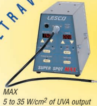
MAX 5 to 35 W/cm 2 of UVA output