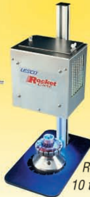
Rocket LP 10 to 20 W/cm 2 of UVA output