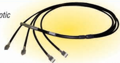
FibreFire™ Fiber Optic Lightguides